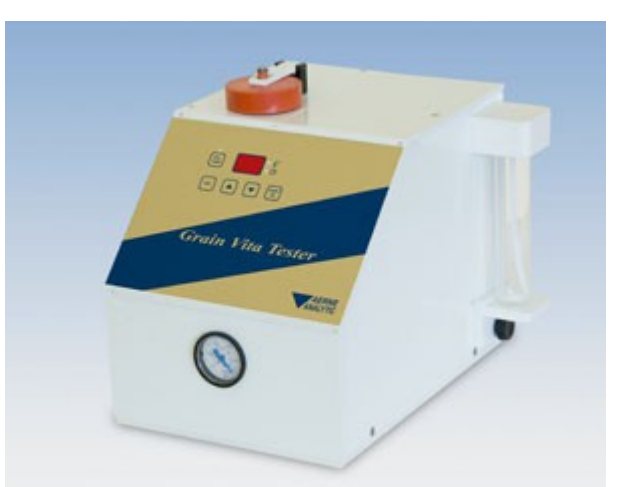
Grain Vita Tester