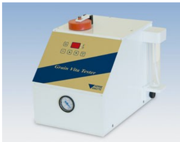
Grain Vita Tester